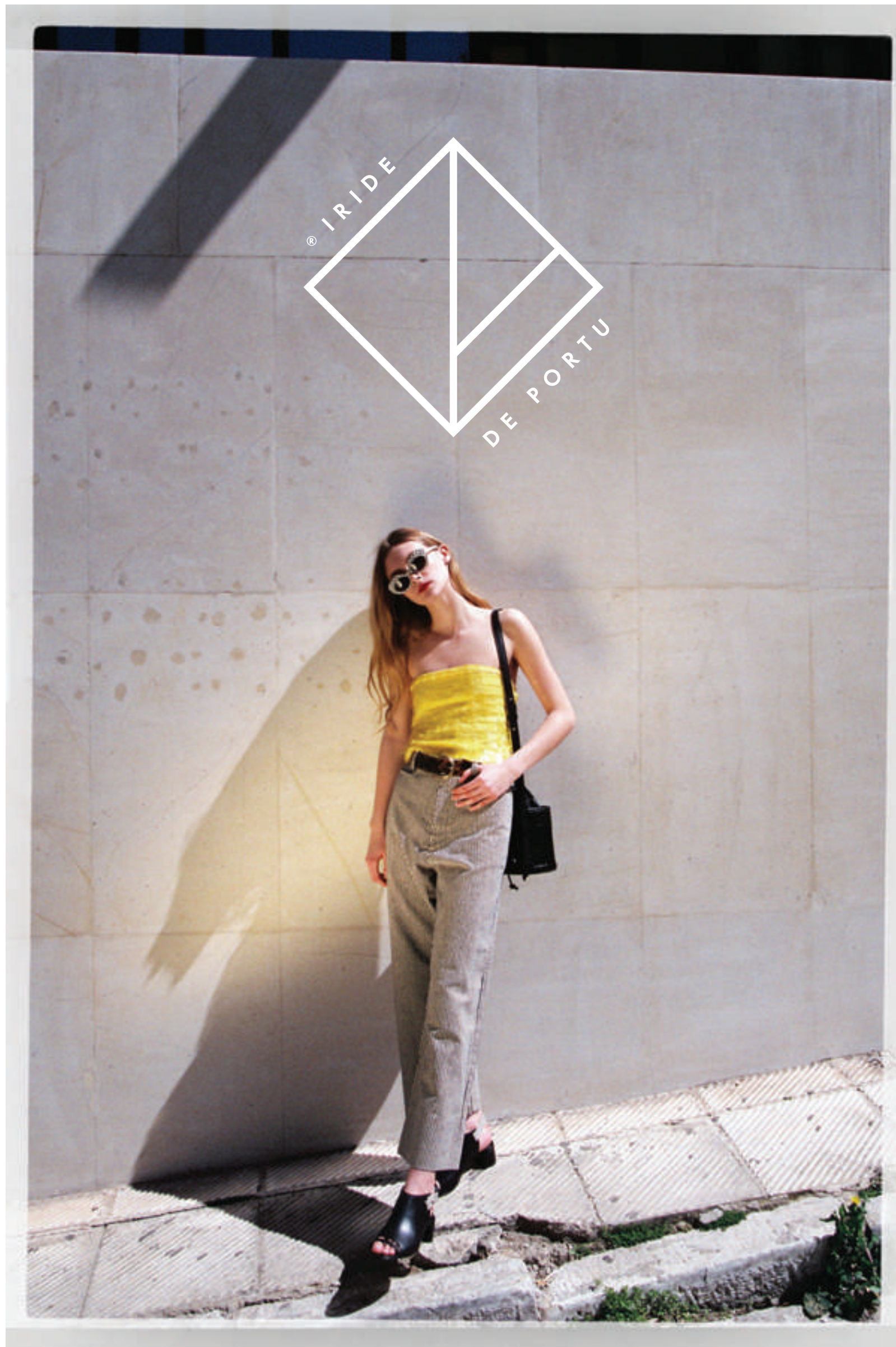
HANDCRAFTED SHOES & BAGS - LOOKBOOK SPRING/SUMMER '18